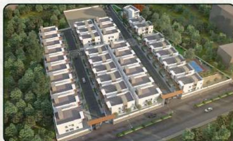
ISKON Avenue, Kovur