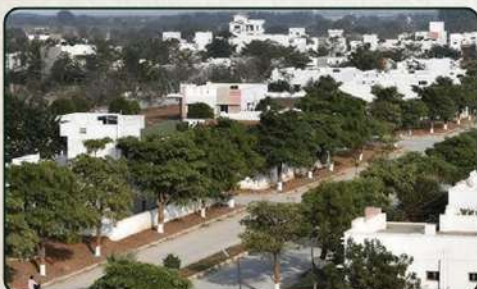
Lotus Avenue, Kagulapadu Buchireddypalem