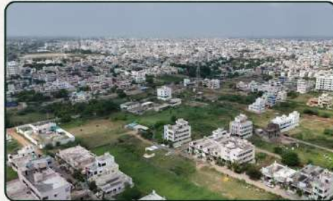
ISKON CITY, A - Block Nellore City