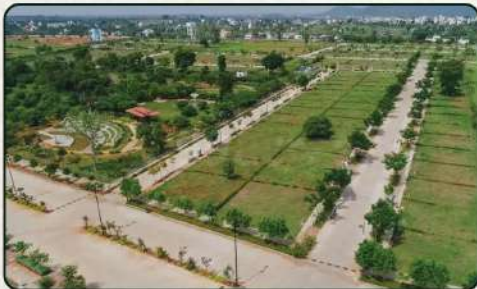
GREEN PARK CITY Nellore City