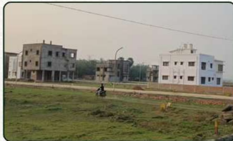
Pinakini Emerald Nellore City