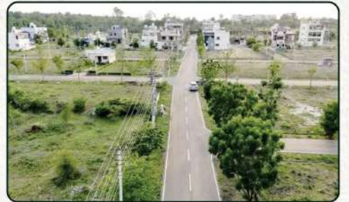
RK Dream Land