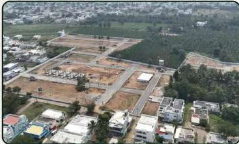
Vidyanagar, Harinathapuram Nellore City