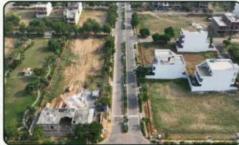
NEW HOMES Muthukur Road