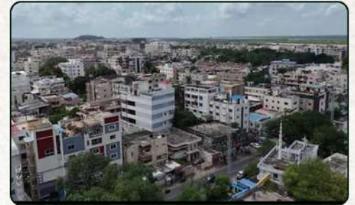
R K Nagar Buchireddypalem