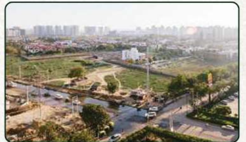
Spark City Atmakur