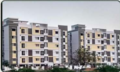
ISKON CITY, Nellore City