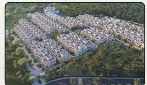
RK Garden City, Near Sakshi Paper Office, Nellore City