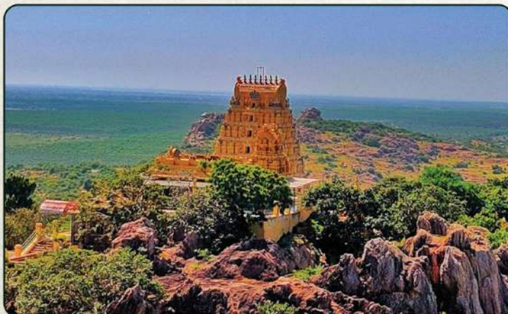
Narasimha Konda Temple